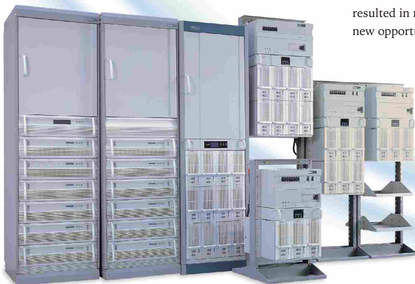
MSC, BSC, BTS

Despite of slow market, China still presented growth figure better than other regions. The reorganization of China Telecom was completed which resulted in several major project kick-off by second half of 2002. European mobile phone operators continued to re-assess 3G rollout plans, and reengineer their global operations; resulted in re-evaluation of power requirements. This provided new opportunities for us to compete in the market place. In US market, we have successfully acquired new OEM projects and achieved a 100% sales growth.