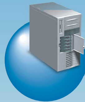
General Purpose Server

Equipped with all the major networking technologies from LAN, broadband, to wireless LAN, Delta Networks has well positioned itself as a dedicated ODM total solution provider for the networking outsourcing opportunities.