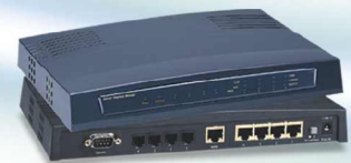
Internet Telephony Gateway (VoIP Gateway)