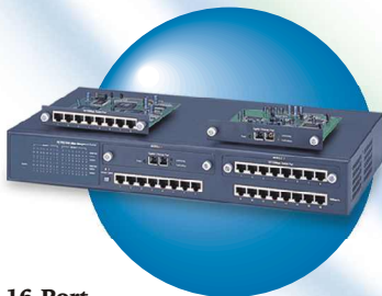
16-Port Gigabit Uplink Switch

Under his leadership, we believe the prospect for our networking business will look even brighter.