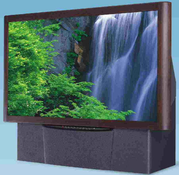
Rear Projection TV

Elected by strategic technology partner due to collective expertises and capability, Delta started co-development on a very high end unique and exclusive project using 3-pc DLP with minimum 5000 lumens brightness and maximum video performance projectors. this product is scheduled to be made available of in the 2nd quarter 2003, aiming large staging / event applications.