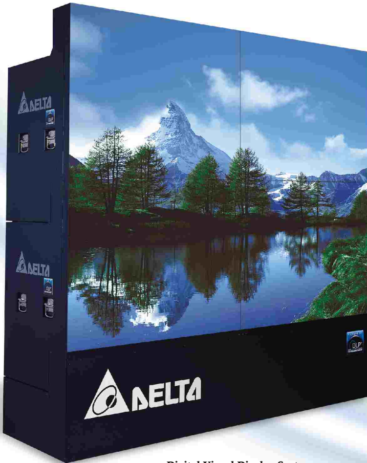
Digital Visual Display System

To satisfy the special demand of digital display system for control room application, or public information system, Delta currently provides solution with 38"/50"/60" video cubes to Japan, N. America as well as Great China area.