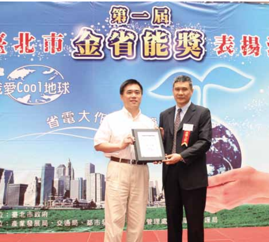
Delta Electronics' Taipei HQ was honored "Gold Energy Saving Award" in the "Industry and Business" category by the Taipei City Government. The award not only represented Delta's continuous efforts of incorporating its concept of environmental protection and energy saving into our colleagues' everyday lives and business operations, but also helped Delta bring this concept to society. Mr. Hao, the mayor of Taipei City, visited Delta's award winning HQ to see Delta's practices in person and encouraged every one to act together to reduce carbon emissions.